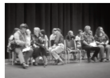
Veteran Speakers Onstage